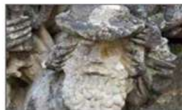
FRANCISCO DE ARRUDA