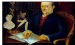
JOAQUIM MACHADO DE CASTRO