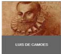
LUIS DE CAMOES