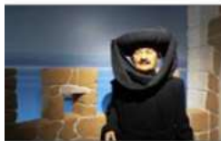
HENRY THE NAVIGATOR