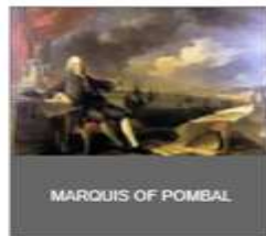
MARQUIS OF POMBAL