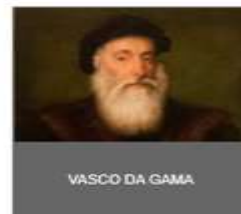
VASCO DA GAMA