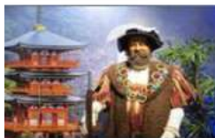
FERNÃO MENDES PINTO