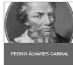
PEDRO ÁLVARES CABRAL