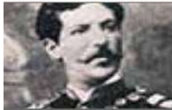
ALEXANDRE DE SERPA PINTO