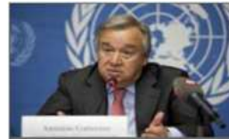
ANTÓNIO MANUEL DE OLIVEIRA GUTERRES