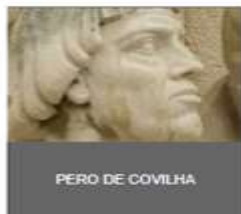
PERO DE COVILHA